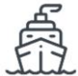
Inland and sea shipping